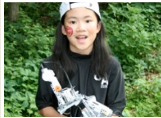
COLLAGE POSTCARDS WITH MESSAGES OF KINDNESS AND GRATITUDE AND ANCIENT MAYAN....ROBOT?!?!?